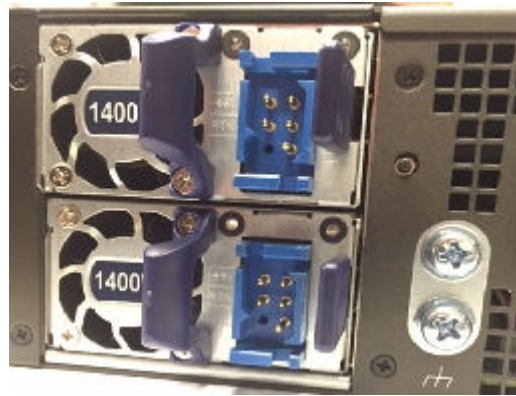
FIGURE 1 DC PSU