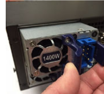
FIGURE 3 Unlocking the PSU